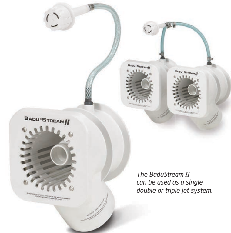
The BaduStream II can be used as a single, double or triple jet system.